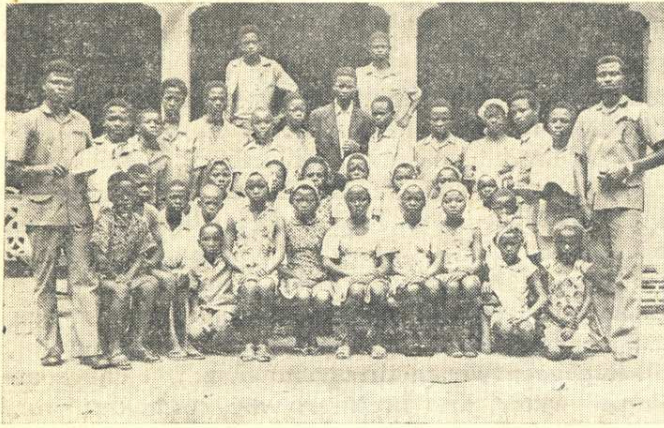
Boys and girls of the Odoro Ikot Church Choir