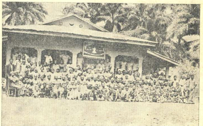
The new church building of the Odoro Ikot group

The opening of the Ikot Uko Church of God's new building was done on December last. We are sorry we did not inform you about this before time. I cannot remember if I wrote to you in my last letter. Here I enclose a picture of the church building. It has 13 open double windows and 6 open double doors. A pulpit was