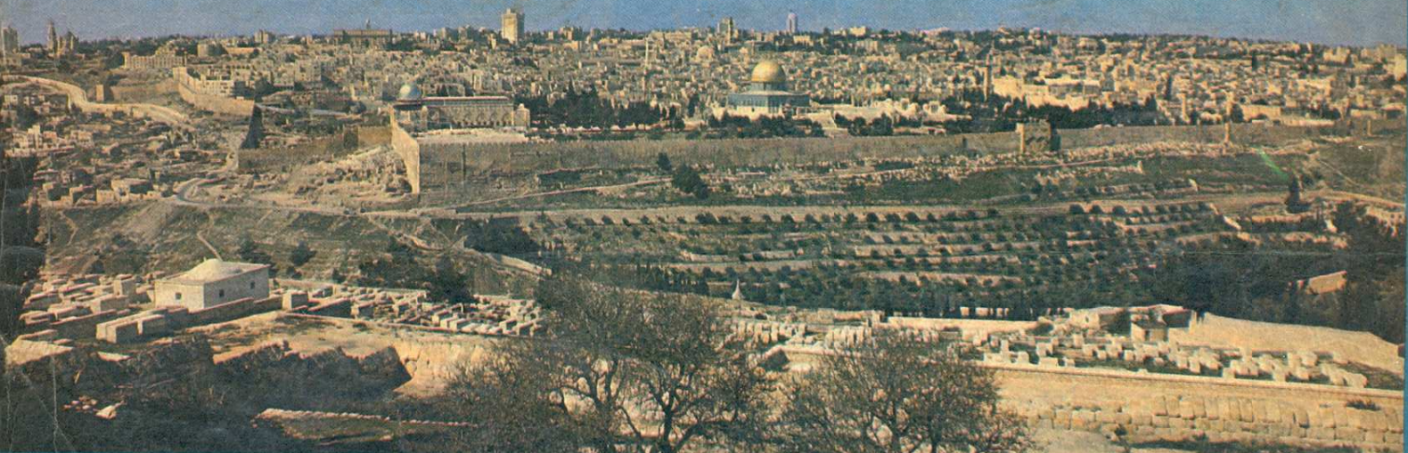
Jerusalem - general view from the Mount Olives. Looking across the Kidron Valley you can see the walls of the Old City. The building in the golden dome is the Mosque of Omar, standing where the ancient Temple stood. In the left background is Mount Zion.