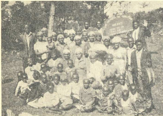
The Church of God group in Mbugiti, Kenya

We have sent tithes and offerings according